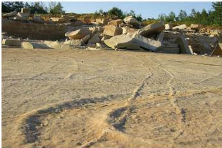
The Fossils of Blackberry Hill